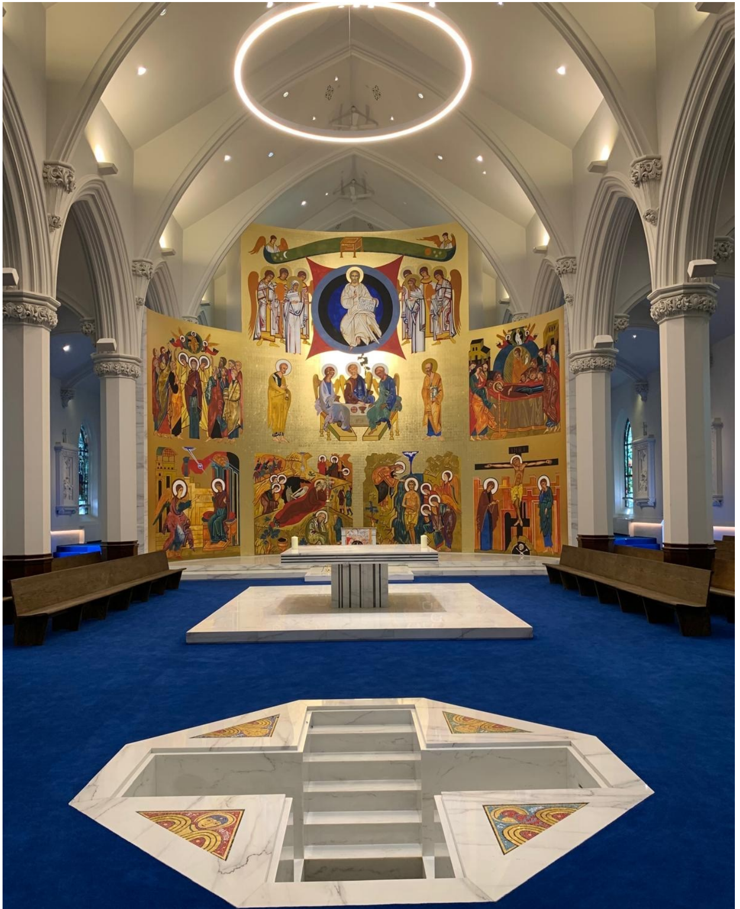
ST. THOMAS AQUINAS, JAMAICA PLAIN 1869—2024